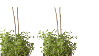
GROW-IT HERB POT BY BJØRN + MIDTGÅRD