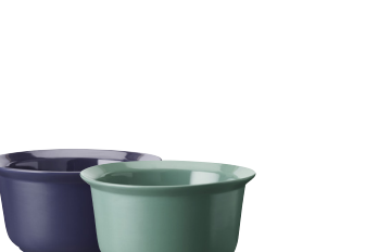
COOK & SERVE OVENPROOF BOWL BY JENS FAGER Blue L (Ø 24 cm) - art. no. Z00504-1 Green L (Ø 24 cm) - art. no. Z00504-2