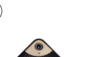
SWEEP-IT DUSTPAN & BROOM BY KLAUS RATH Art. no. Z00073