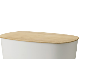
BOX-IT BREAD BOX BY JEHS+LAUB ● Black - art. no. Z00038 ● White - art. no. Z00038-1 ● Warm grey - art. no. Z00038-3 ● Dark blue - art. no. Z00038-4 ● Light grey - art. no. Z00038-7