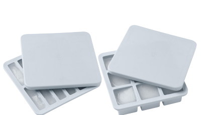
FREEZE-IT ICE CUBE TRAY WITH LID BY RIG-TIG S - art. no. Z00050 L - art. no. Z00051