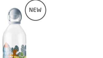
RIG-TIG X MOOMIN COOL-IT WATER CARAFE 1.5 L BY FRANCIS CAYOUPETTE