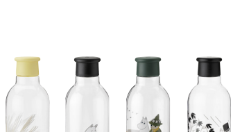
RIG-TIG X MOOMIN DRINK-IT DRINKING BOTTLE 0.75 L BY FRANCIS CAYOUPETTE