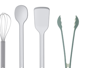
COOK-IT - GREY + GREEN BY SØREN REFSGAARD Whisk - grey - art. no. Z00290-1 Stirrer - L - grey - art. no. Z00291-1 Palette - grey - art. no. Z00293-1 Tongs for pasta or salad - green - art. no. Z00294