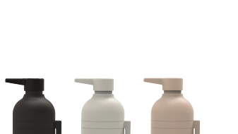
PUMP-IT DISPENSER BY UNIT 10