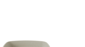
TRAY-IT BREAD TRAY BY JENS FAGER Grey - art. no. Z00140