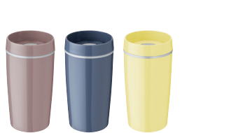
BRING-IT TO-GO CUP 0.34 L BY RIG-TIG