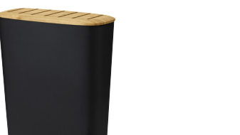
BLOCK-IT KNIFE BLOCK BY JEHS+LAUB Black - art. no. Z00348