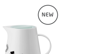
RIG-TIG X MOOMIN HOTTIE VACUUM JUG 1 L BY ULRIK NORDENTOFT