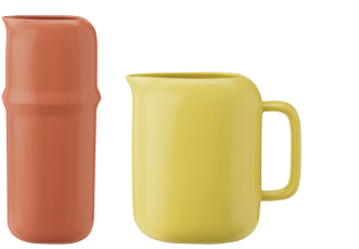
POUR-IT BY PIERRE FOULONNEAU Carafe 1 L - orange - art. no. Z00170 Jug 1 L - yellow - art. no. Z00171