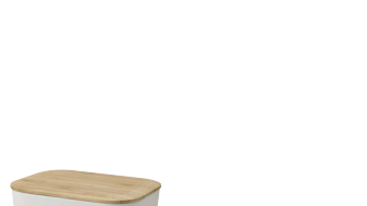
BOX-IT BUTTER BOX BY JEHS+LAUB ● Black - art. no. Z00096-1 ● White - art. no. Z00096 ● Warm grey - art. no. Z00096-2 ● Dark blue - art. no. Z00096-4 ● Light grey - art. no. Z00096-7