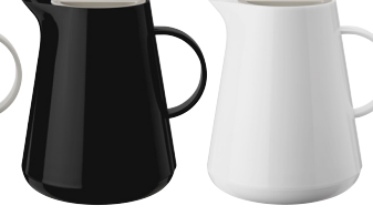
HOTTIE VACUUM JUG BY ULRIK NORDENTOFT Grey - art. no. Z00026-1 Black - art. no. Z00026-2 White - art. no. Z00026