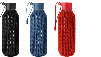
CATCH-IT DRINKING BOTTLE 0.6 L BY ELISABETH KRENKLER