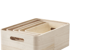
SAVE-IT STORAGE BOXES, 5 PCS. BY RIG-TIG Art. no. ZPR4