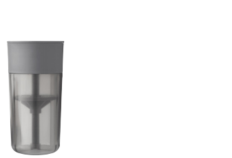
CHEESE-IT PARMESAN MILL BY SØREN REFSGAARD Art. no. Z00055