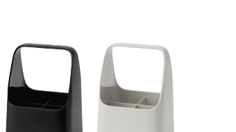
HANDY BOX STORAGE BOX, S BY JEHS+LAUB Black - art. no. Z00126 Light grey - art. no. Z00126-1