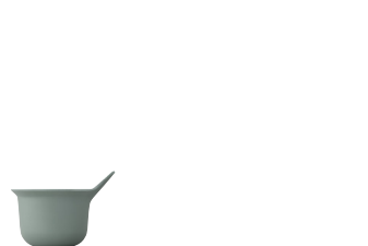
MIX-IT MEASURING CUP 1 DL. BY JENS FAGER Art. no. Z00210