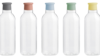
DRINK-IT DRINKING BOTTLE 0.75 L BY FRANCIS CAYOUPETTE