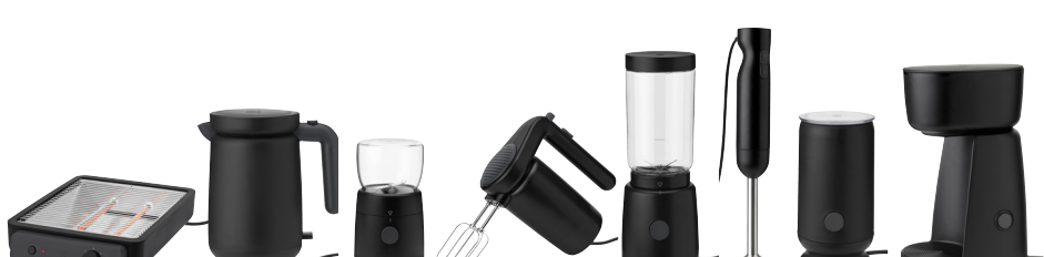
FOODIE - BLACK BY UNIT 10