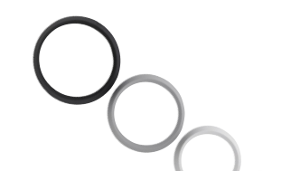
PLACE-IT TRIVETS, 4 PCS. BY FORMFJORD Art. no. Z00031-1