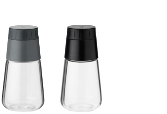
SHAKE-IT DRESSING SHAKER BY ULRIK NORDENTOFT Grey - art. no. Z00039-1 Black - art. no. Z00039-2