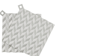
HOLD-ON POT HOLDERS, 2 PCS. BY SØREN REFSGAARD Dark grey - art. no. Z00208 Misty rose - art. no. Z00208-1 Dusty green - art. no. Z00208-2 Dark blue - art. no. Z00208-4 Black - art. no. Z00208-7 Light grey - art. no. Z00208-8