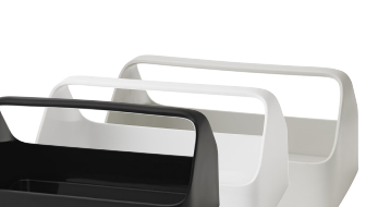
HANDY BOX STORAGE BOX, L BY JEHS+LAUB Black - art. no. Z00125 White - art. no. Z00125-1 Light grey - art. no. Z00125-2