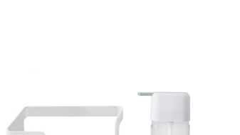
SINK-CADDY BY TROELS SEIDENFADEN