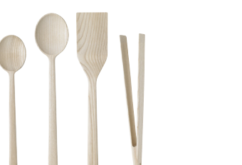
WOODY BY SØREN REFSGAARD Small stirrer - art. no. Z00295 Large stirrer - art. no. Z00296 Palette - art. no. Z00297 Turn tongs - art. no. Z00298