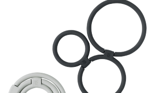
CIRCLES TRIVETS BY ALQUEMY Black - art. no. Z00058 Light grey - art. no. Z00058-1