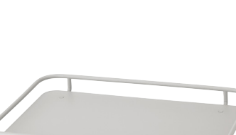
CARRY-ON SERVING TRAY BY SØREN REFSGAARD Art. no. Z00220