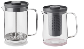
BREW-IT BY FRANCIS CAYOUPETTE French press - art. no. Z00420 Press tea maker - art. no. Z00421