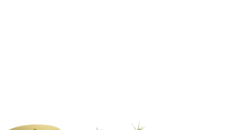
YOUR TREE PLANTING POT WITH SEEDS BY RIG-TIG