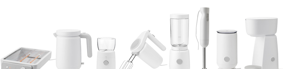
FOODIE - WHITE BY UNIT 10