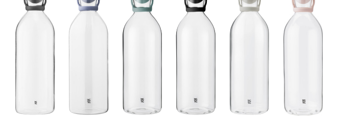
COOL-IT WATER CARAFE 1.5 L BY FRANCIS CAYOUPETTE Dark grey - art. no. Z00071-3 Dark blue - art. no. Z00071-5 Dusty green - art. no. Z00071-6 Black - art. no. Z00071-7 Light grey - art. no. Z00071-8 Rose - art. no. Z00071-9