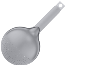
DROP COLANDER BY VIVIANA DEGRANDI Art. no. Z00209-1