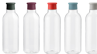
Dark green - art. no. Z00212-6 Aubergine - art. no. Z00212-7 Warm red - art. no. Z00212-8 Aqua - art. no. Z00212-9 Light grey - art. no. Z00212-10