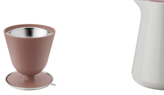
SLOW COFFEE BREWER BY DEBIASI & SANDRI Art. no. Z00030