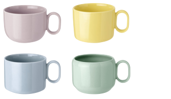
MIX'N'MATCH MUGS, 4 PCS. BY DEBIASI & SANDRI Blue, yellow, pink, green - art. no. Z00141