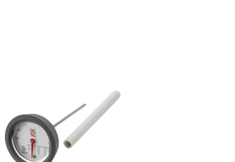
NAIL-IT MEAT THERMOMETER BY SØREN REFSGAARD Art. no. Z00211