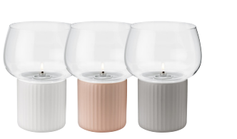
HYGGE HURRICANE BY HALSKOV & DALSGAARD White - art. no. Z00137 Rose - art. no. Z00137-1 Grey - art. no. Z00137-2 2 pcs. Vegetable candle for HYGGE Hurricane - art. no. R-96