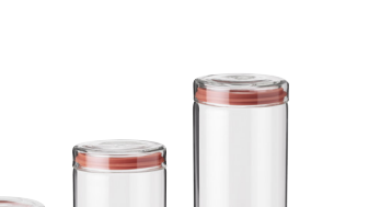
STORE-IT STORAGE JAR BY SØREN REFSGAARD S (0.5 L) - art. no. Z00230 M (1 L) - art. no. Z00231 L (1.5 L) - art. no. Z00232