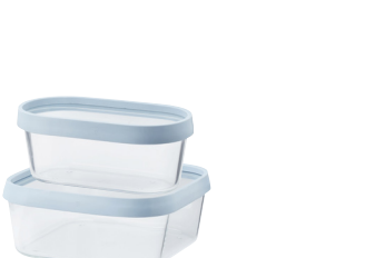
COOK & FREEZE OVENPROOF DISH / STORAGE BOX BY SØREN REFSGAARD M (850ml): art. no. Z00151 L (2 L): art. no. Z00150