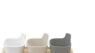
TAPAS SERVING SET BY PIERRE FOULONNEAU Art. no. Z00139