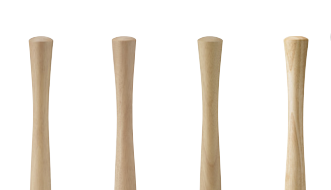
ROLL-IT KITCHEN ROLL HOLDER BY SØREN JAKOBSEN