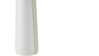
PICNIC VACUUM INSULATED BOTTLE WITH 4 CUPS BY UNIT 10 Art. no. Z00280