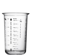
MEASURING CUP 1 L BY JENS FAGER Art. no. Z00203