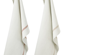
EVERYDAY TEA TOWELS, 2 PCS. BY RIG-TIG Art. no. Z00113