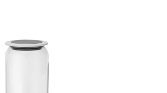
GOODIES STORAGE JAR BY PIERRE FOULONNEAU L (1.5 L) - art. no. Z00167