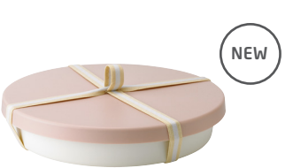
PICNIC CAKE PAN WITH LID Ø 25 CM BY UNIT 10 Art. no. Z00281