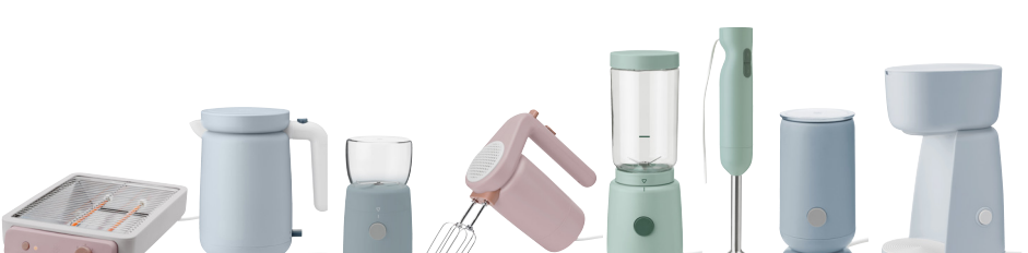
FOODIE - PASTEL BY UNIT 10