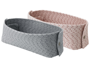
KNIT-IT BREAD BASKET BY TWELVE DEGREES DESIGN STUDIO Grey - art. no. Z00146 Rose - art. no. Z00146-1