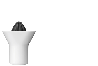
ORANGE SQUEEZER BY JENS FAGER Art. no. Z00035