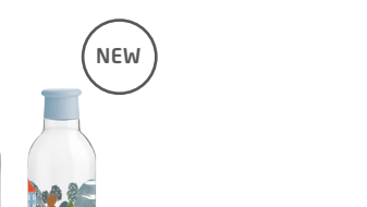
RIG-TIG X MOOMIN DRINK-IT DRINKING BOTTLE 0.75 L BY FRANCIS CAYOUPETTE